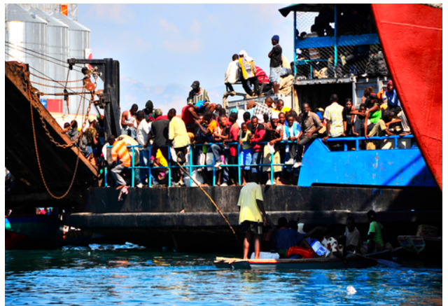
PORT-AU-PRINCE, Haiti - Hundreds of Haitians pile into a ferry headed away from Port-au-Prince, Jan. 20, 2010. Millions were displaced from their homes after a 7.0 magnitude earthquake struck Haiti’s capital, Jan. 12, 2010.