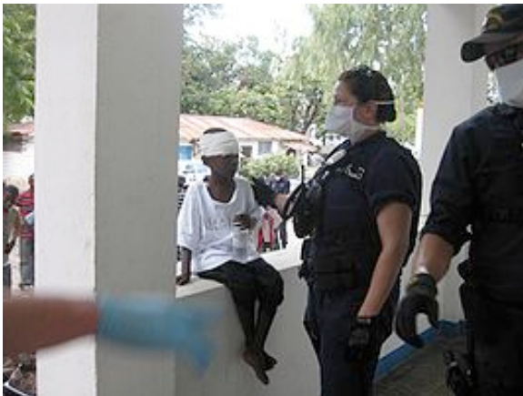
PORT-AU-PRINCE, Haiti - A Coast Guard member provides a bottle of water and a comforting hand to a Haitian boy in Port-au-Prince, Haiti, Jan. 14, 2010. Coast Guard crewmembers from across the United States have been deployed to provide assistance to Haiti.

As the areas surrounding Port-au-Prince move from chaos to organized effort, there will be additional hands-on opportunities to help, as well. Pray about how God might want to use you. It only took 35 seconds to initiate this devastation, but it’s going to take years and years to overcome it. Let’s be inspired by Nehemiah’s example, and display “a mind to work.”