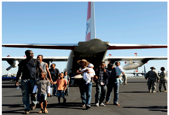
HOMESTEAD, Fla. - Haitian evacuees exit a U.S. Coast Guard C-130 Hercules aircraft at Homestead Air Reserve Base, Fla., Jan. 20, 2010. An earthquake hit Haiti Jan. 12, 2010, leaving approximately 1.5 million people without homes. Homestead ARB has become a hub for evacuees in need of aid.