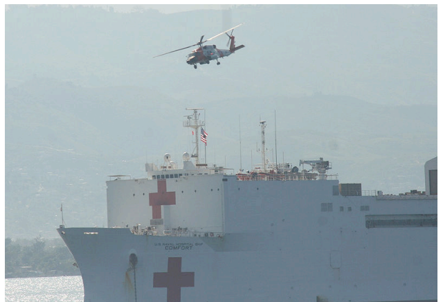
PORT-AU-PRINCE, Haiti - A Coast Guard HH-60 helicopter brings injured Haitians from a landing zone in Killick in the Haitian coast guard base to the USNS Comfort for medical treatment Wednesday, Jan. 20, 2010.